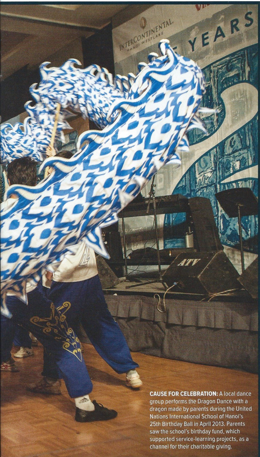
CAUSE FOR CELEBRATION: A local dance group performs the Dragon Dance with a dragon made by parents during the United Nations International School of Hanoi's 25th Birthday Ball in April 2013. Parents saw the school's birthday fund, which supported service-learning projects, as a channel for their charitable giving.