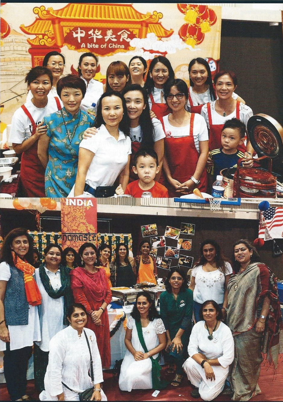
WORLD FLAVORS: During the Singapore American School's annual international fair, families from the same country teamed up at food booths to compete with other booths to raise money. Participants pose at the China booth (top left), India booth (bottom left); and Korea booth (right).