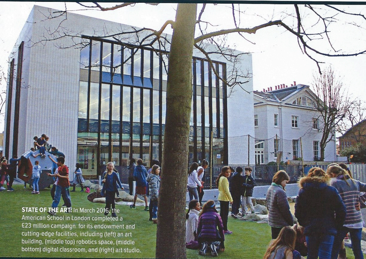
STATE OF THE ART In March 2016, the American School in London completed a £23 million campaign for its endowment and cutting-edge facilities, including (left) an art building, (middle top) robotics space, (middle bottom) digital classroom, and (right) art studio.