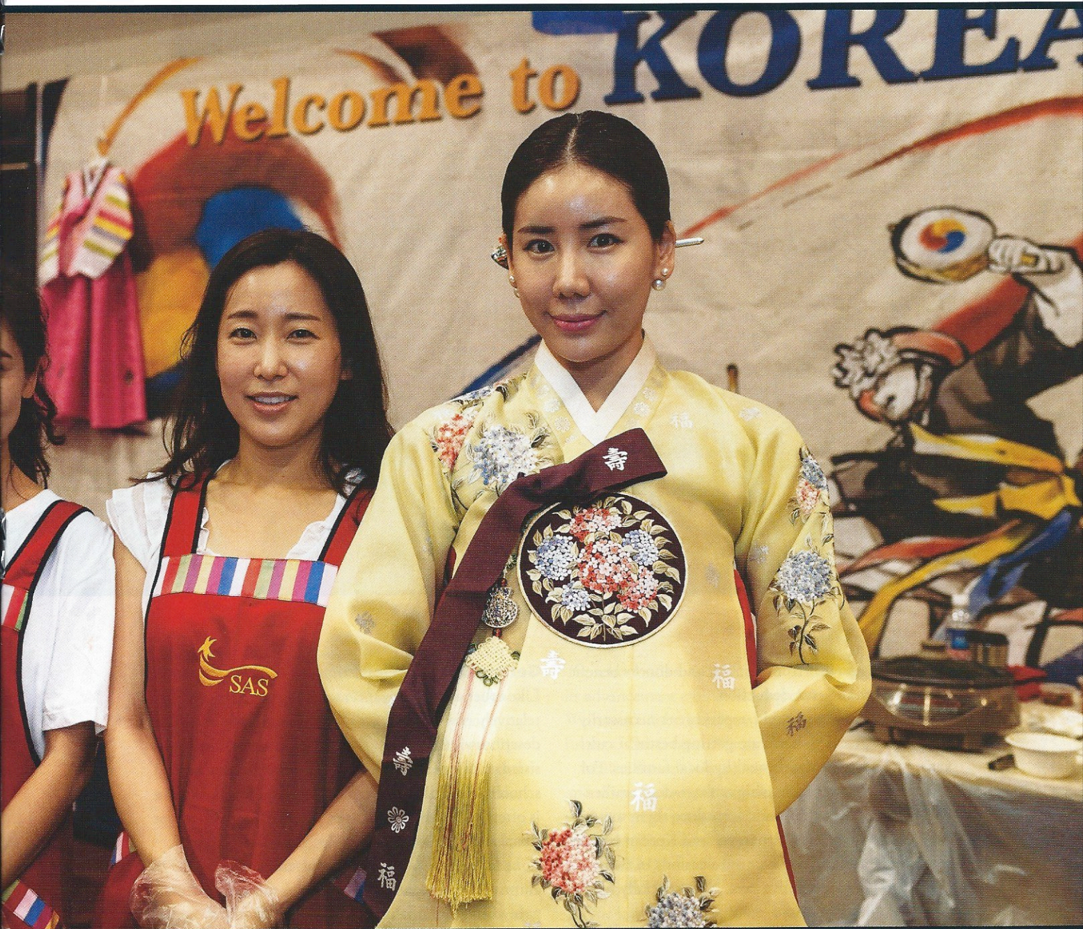
SINGAPORE AMERICAN SCHOOL